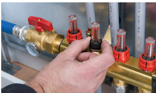
Fig. 7: Open ball valves and all flow meters completely.