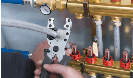
Fig. 1: Before connecting the heating circuit to manifold cleanly cut off FH composite pipe in the correct length.