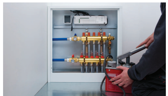
Fig. 6: Label the individual heating circuits. Carry out pressure test in accordance with the pressure test protocol.