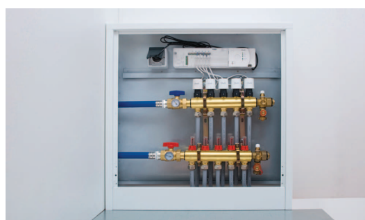
Fig. 10: Finally, fit cabinet door.

Danfoss A/S Heating Solutions Haarupvaenget 11 8600 Silkeborg Denmark Phone: +45 7488 8000 Fax: +45 7488 8100 Email: ComfortControlsInternet@danfoss.com www.heating.danfoss.com