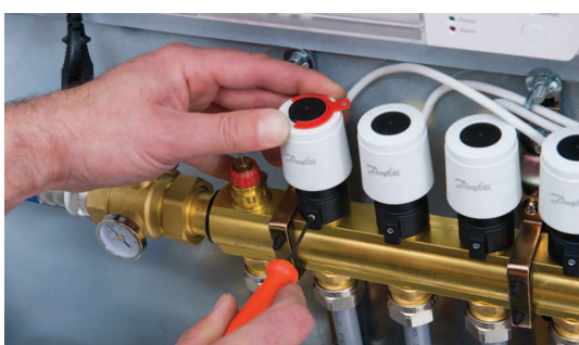
Fig. 9: Fix actuator to valve with a 2 mm Allen key and connect actuator and room thermostats via wiring centre or master controller.