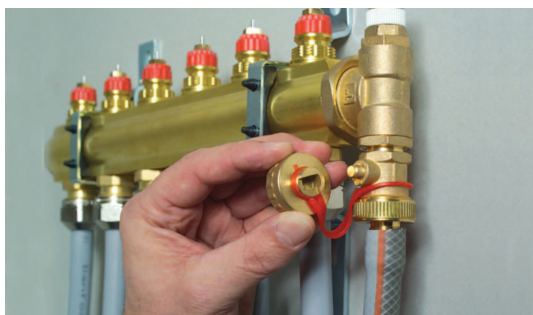
Fig. 5: Shut off main supply and return ball valves. Heating circuits are individually flushed via fill and drain valves mounted on respectively supply and return manifold.