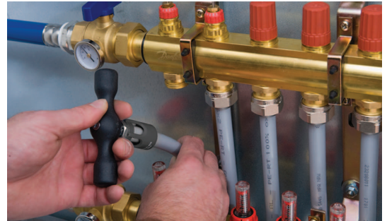
Fig. 2: Centre pipe and bevel with bevelling tool - 2 mm all round bevel on inner pipe.