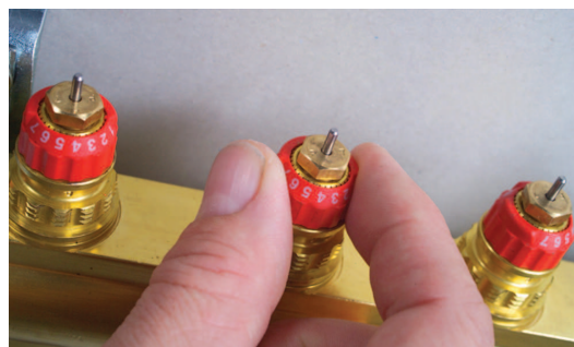
Fig. 8: Preset manifold valve for each heating circuit according to calculations and manifold data sheet.